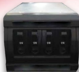
DC / DC Distribution Frame